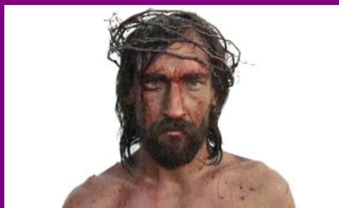
The Passion BBC ONE

Followed by a walk to St James Church with 5 acts of worship on the way (aiming to finish by 11.00am)